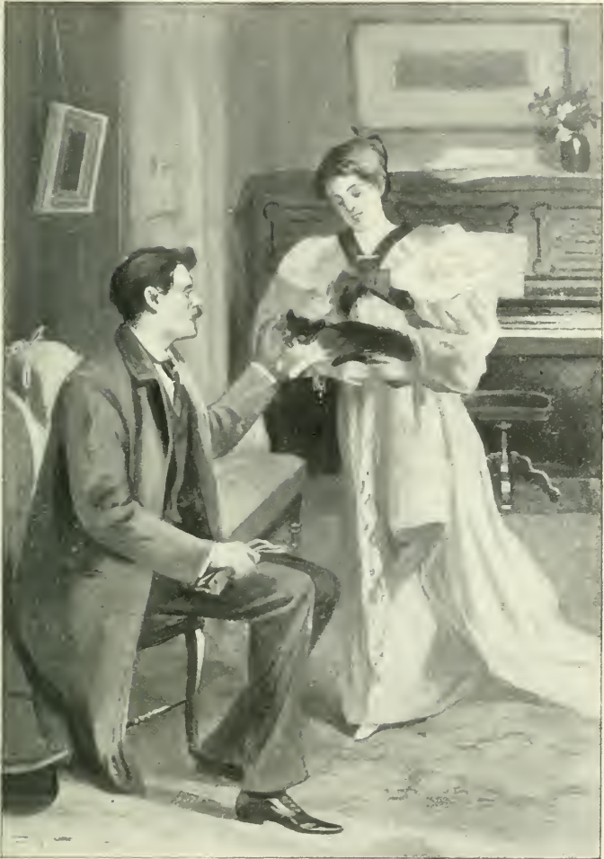
"Don't you admire him?"—Page 88